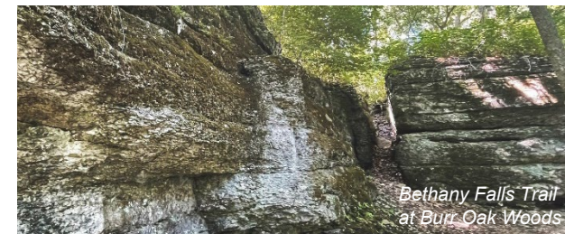
Bethany Falls Trail at Burr Oak Woods