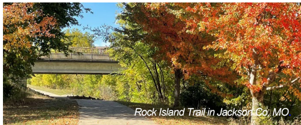
Rock Island Trail in Jackson Co. MO

Research shows that hiking is GOOD FOR YOU , with mental & physical benefits. In the KC area, we enjoy many WONDERFUL FREE TRAILS . Click on the name of each trail (if you are using this guide online) or visit TAKEAHIKEKC.ORG for online links. Follow @takeahikekc Facebook & Instagram!